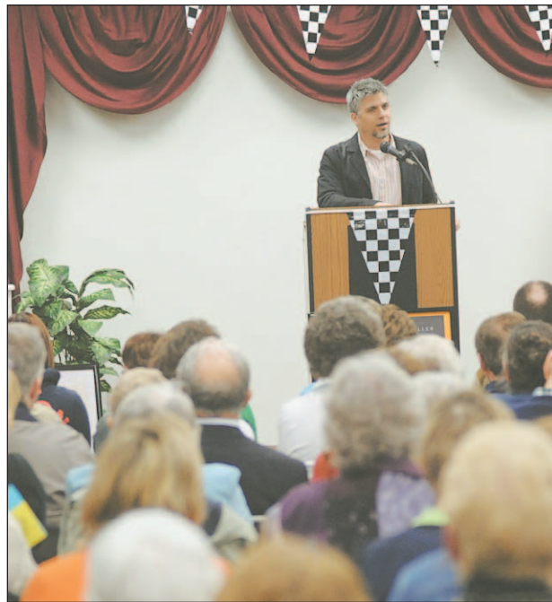
RIGHT: Author Garth Stein speaks at Lee-Weldon Memorial Library, Medina, where a 152 people came for the "A Tale for Three Counties" program. Record attendance was recorded at all four venues where Stein spoke.

come back and do all the things he sees the people around him doing. But he also wants to remain a dog. He loves the family he's with. It's a classic double, and contained in this is the tension that creates the character.